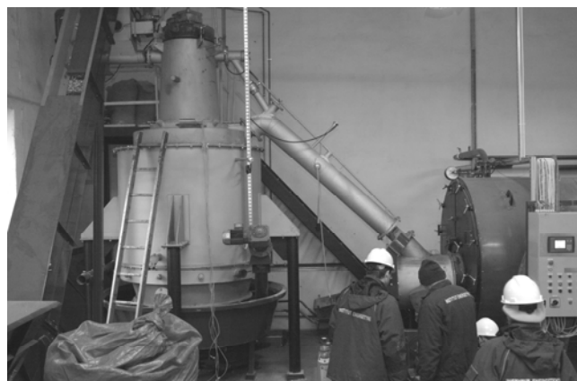
Fig. 1. The counter-current gasifier used in the experiment

The process of gasification of willow biomass from plants produced in the Eko-Salix system was examined in a pilot plant at the University of Warmia and Mazury in Olsztyn. The system consisted of the following parts: a counter-current gasifier with the power capacity of 500 kW (Fig. 1) with continuous fuel feed, water sealing and mechanical ash removal; a fuel scraper feeder with a buffer tank and a separating lock; an ash removal cone with afterburning air nozzles; a water sealing tank; an afterburning air fan; a gasifying air fan; a water boiler; a gas pipeline; a process gas burner; an oil pilot burner and a burner air fan.