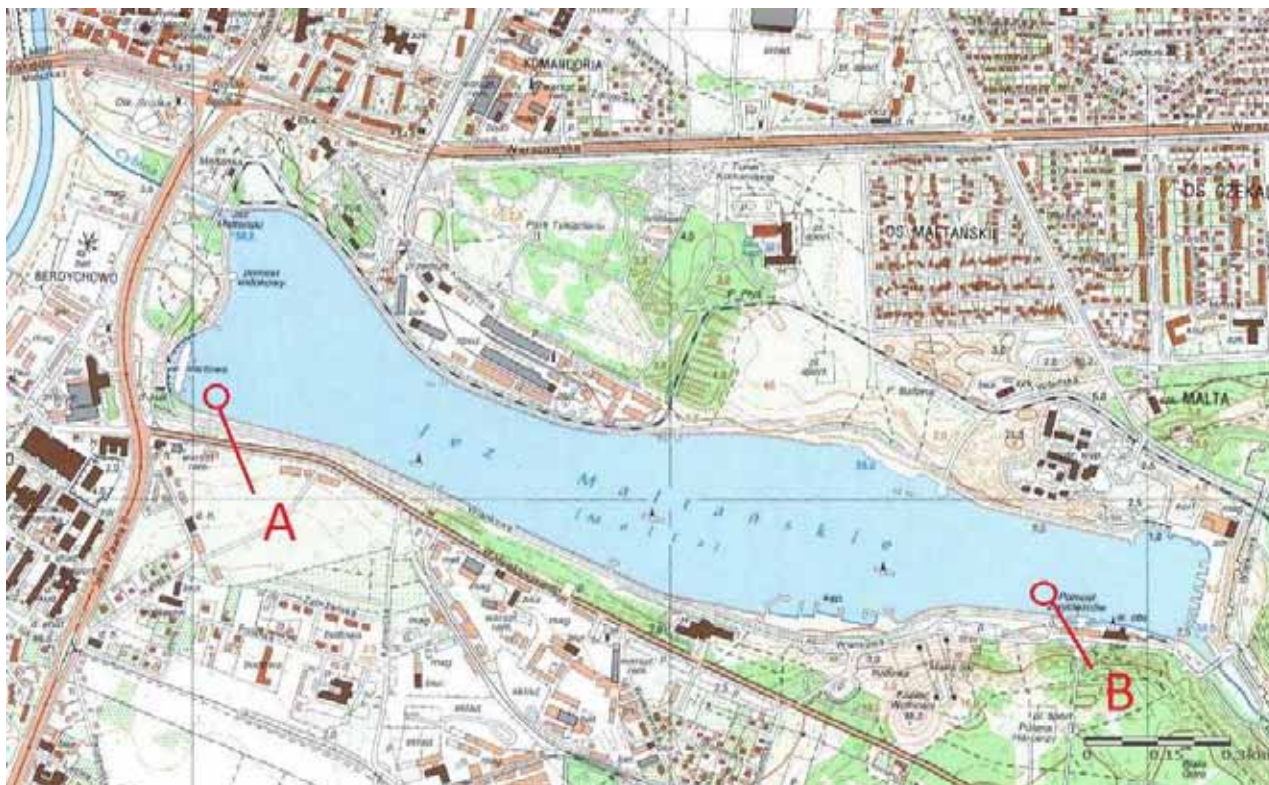
Figure 1. The location of measurement points (A and B) [11]

B_n^i – defined geochemical background for a given heavy metal.