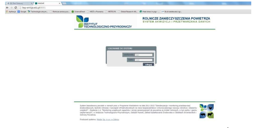
Fig. 1. Login screen Rys. 1. Ekran logowania do systemu